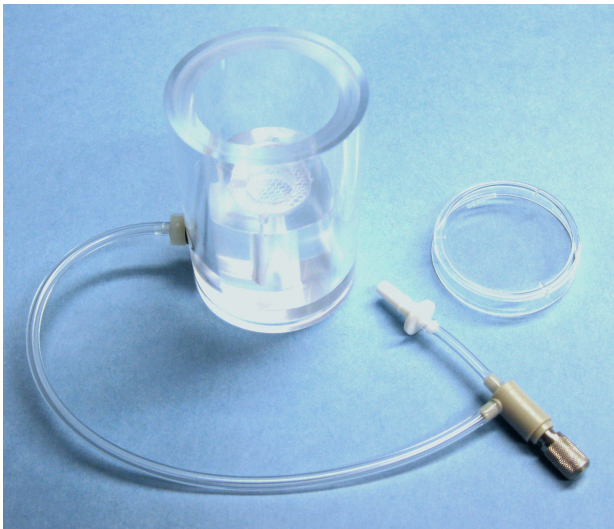
BSK2 Components - chamber with insert in place, needle valve gas flow regulator and lid.