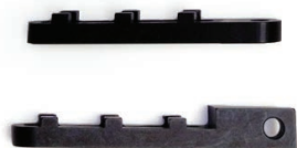
"Interlocking" arms hold other arms at 90° angles (SH-ISTA & -IRAA)