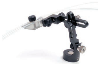
StageHand with magnetic base, two "arms" and dual tube holder.