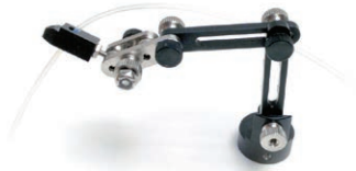
StageHand with magnetic base, two straight arms, locking ball joint and single tube holder.