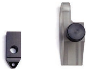
Single (SH-TH) and dual (SH-DTH) tube holders