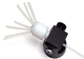
Manifold holder (manifold not included) (SH-MH-MS)